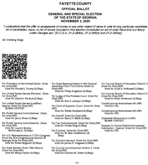
Figure 3 Scanned BMD ballot