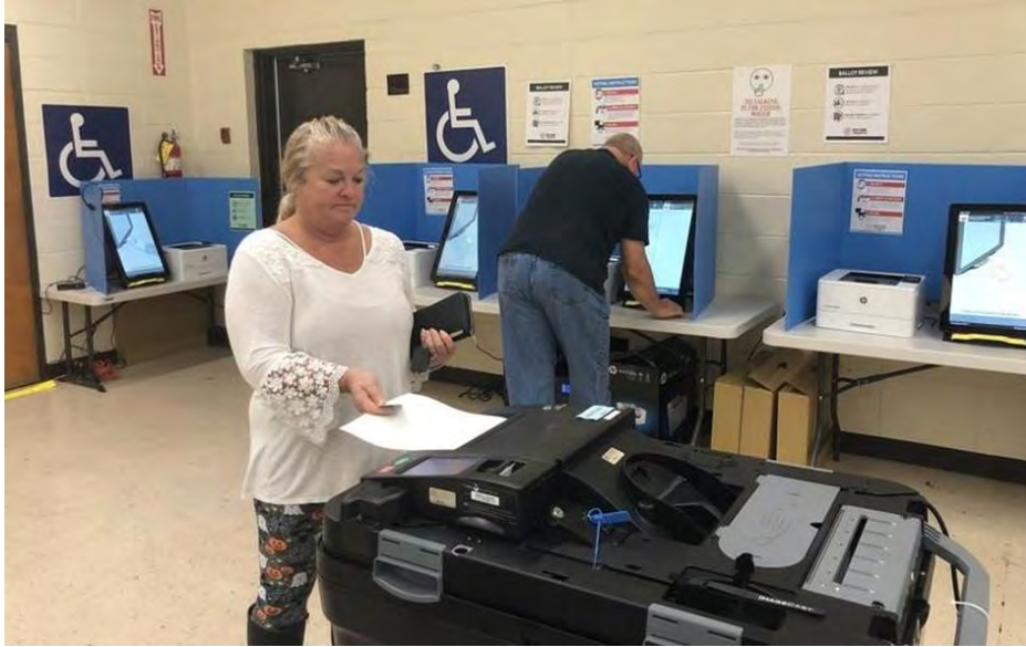
Figure 5. Cartersville, Georgia Polling Place

435. Figure 6 is a true and correct photograph of the inside of the State Farm Arena polling place in Fulton County, Georgia, taken in October 2020, during early voting for the General Election.