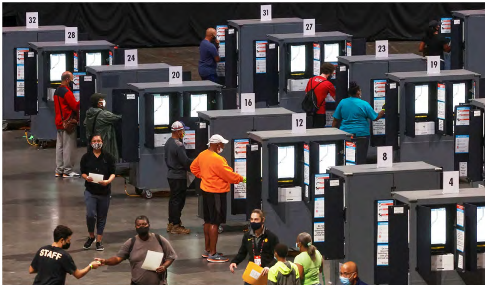
People cast their ballots during early voting for the presidential elections at State Farm Arena in Atlanta, Ga., October 12, 2020.

435. Figure 6 is a true and correct photograph of the inside of the State Farm Arena polling place in Fulton County, Georgia, taken in October 2020, during early voting for the General Election.